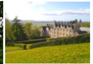
St Beuno's where Hopkins trained as a Jesuit