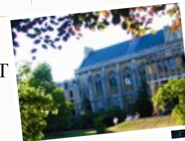
Oxford where Hopkins was 'Star of Balliol'