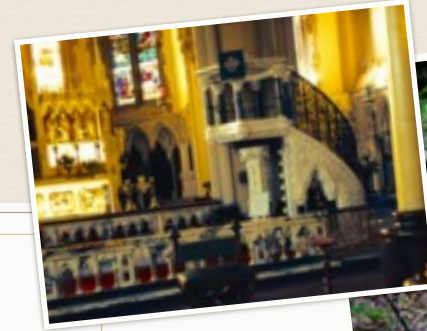
St Francis Xavier Church Liverpool, with the pulpit Hopkins used