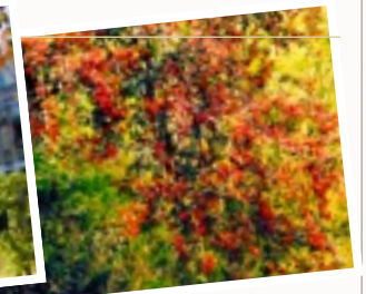
'Summer ends now' - an mage from one of our Hopkins walks