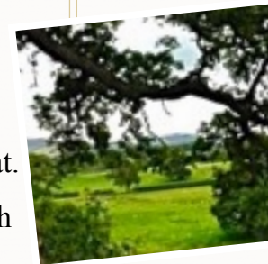
Countryside near St Beuno's