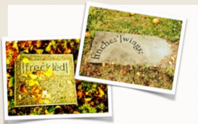
Images of the 'Angel Fields' Hopkins Garden at Liverpool Hope University

The Hopkins Society exists to celebrate Gerard Manley Hopkins' life and work. We hold meetings twice a year in varied formats - poetry readings, performance workshops, the annual Hopkins Lecture, visits and walks to places influential in his life and work. We also produce an annual journal.